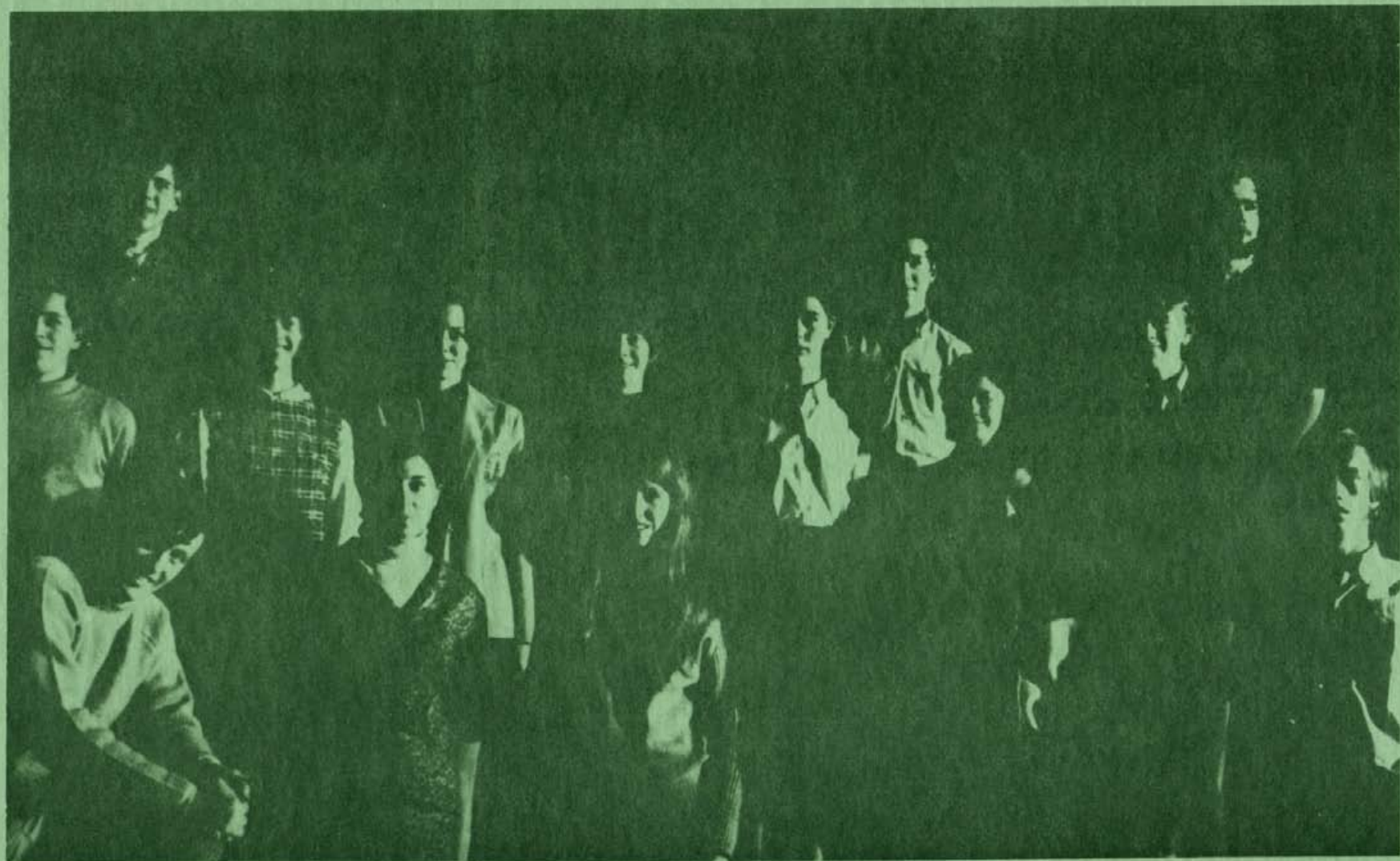
THE CAST OF RHINOCEROS